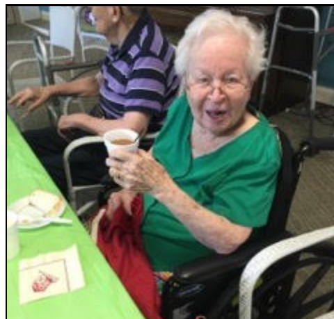
Resident with Lap Quilt and Coffee

Each July UMW Circles take turns hosting a coffee at The Hermitage on Westwood Avenue. On July 19, Circles 5 and 6 participated. We brought 100 bags of cookies, cheese